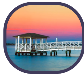
32 | Fort Myers, Florida