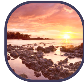
12 | Kohala Coast, Hawaii