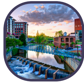
10 | Greenville, South Carolina