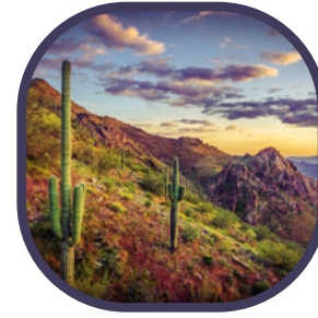
30 | Tucson, Arizona