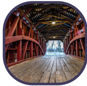
14 | Lancaster, Pennsylvania