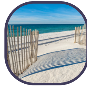
22 | Orange Beach, Alabama