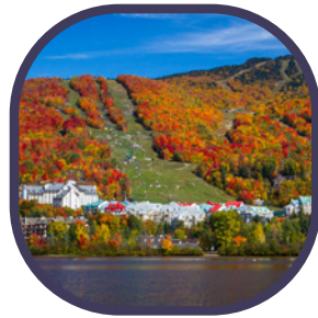
17 | Mont-Tremblant, Québec