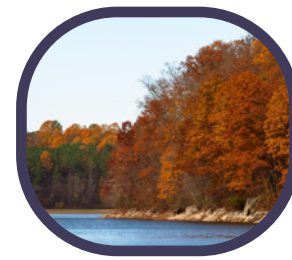
33 | Triadelphia, West Virginia