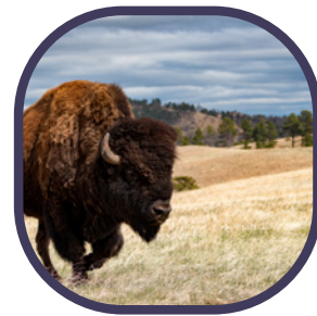
25 | Rapid City, South Dakota