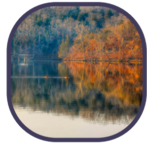
6 | Branson, Missouri