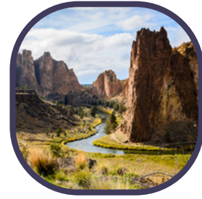
28 | Redmond, Oregon