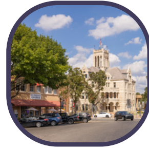
19 | New Braunfels, Texas